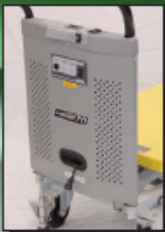
Full shielding of all electrical components