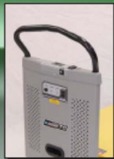
Ergonomic comfort shape handle