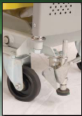
Smooth rolling casters and floor lock