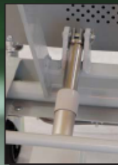
High-speed linear actuator for clean, precise positioning