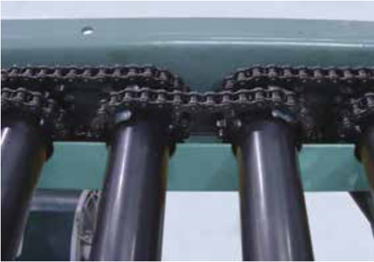
CHAIN GUARD REMOVED TO ILLUSTRATE ROLL TO ROLL DRIVE CHAIN.

WARNING: DO NOT OPERATE CONVEYOR WITH CHAIN GUARD REMOVED.