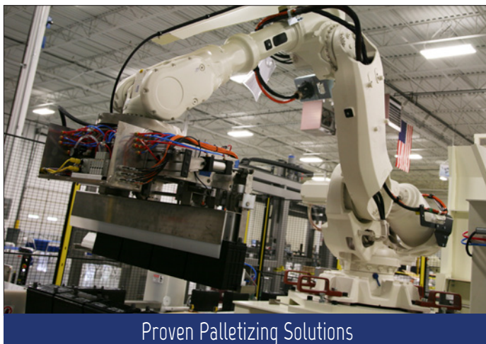
Proven Palletizing Solutions