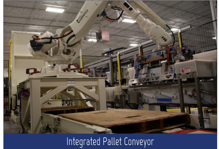
Integrated Pallet Conveyor