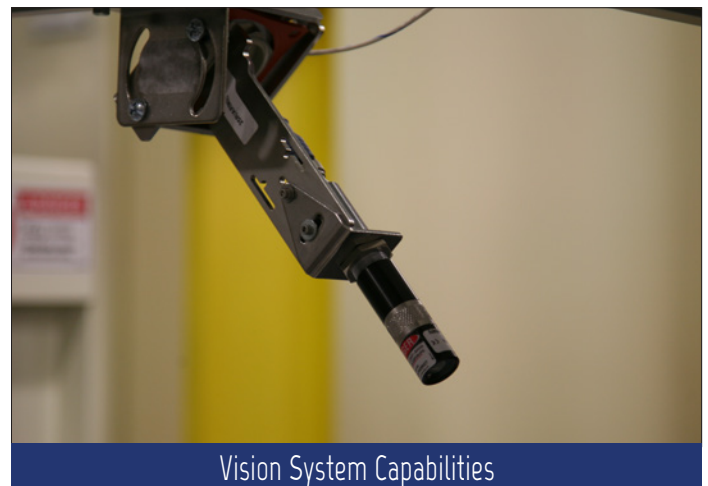
Vision System Capabilities