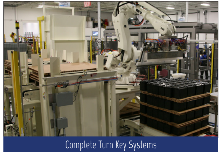
Complete Turn Key Systems