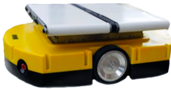
tSort+ t-Sort+: Tray & Crossbelt