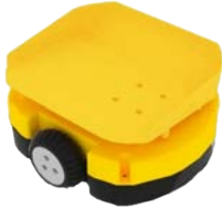
tSort mini t-Sort Mini: Tray