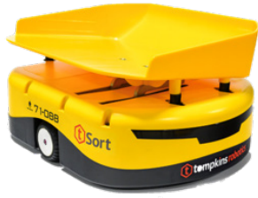
tSort t-Sort: Tray & Crossbelt