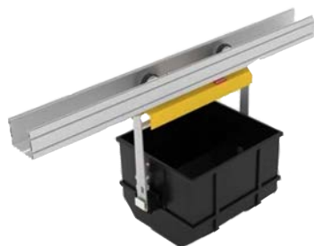
tRail t-Rail: Tote & Hopper

New product for use in Distribution Centers – all channels. A unique application moving goods and material in retail and MFC. Major cost savings and space savings.